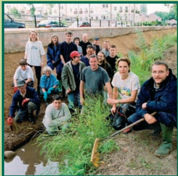
PERTH &amp; KINROSS COUNCIL

The shelf was stabilised with coconut fibre placed in the water and secured with wooden stakes. Wetland plants such as Yellow flag, Meadowsweet and Sedges were planted. This type of habitat will attract a rich diversity of species and may well encourage the return of the long-absent Water Vole to a Perth burn.