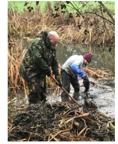
© D.Muir and © C A G Lloyd