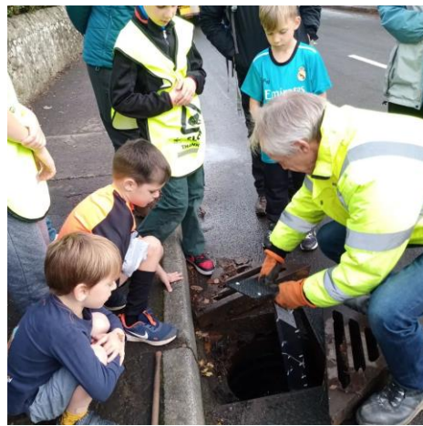
Amphibian ladder making workshop